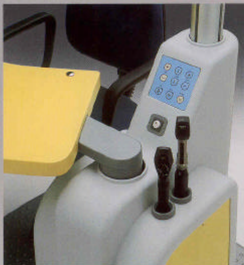
Supporto strumenti a mano Hand instruments support